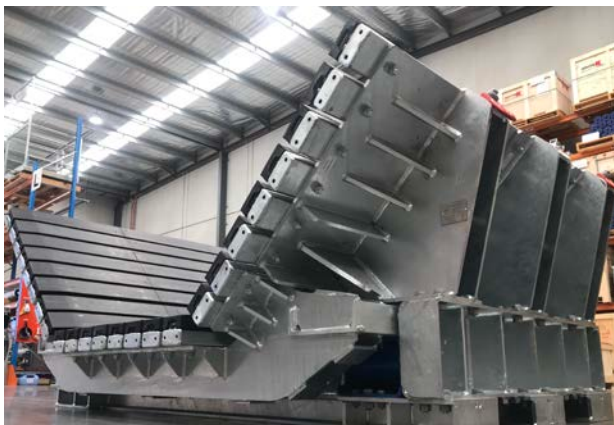
XHD Model Shown