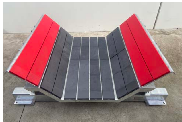
With K-Glideshield® High Speed/Capacity Centre Rails Shown