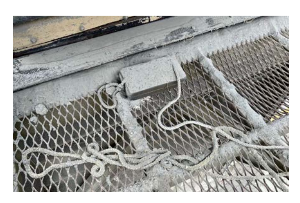
BEFORE PHOTOS: Rubber block attached to rope.

Our Victorian Quarry customer are leaders in the construction materials sector, they provide superior quarry products and top-notch technical advice to match. Since their inception in 1986, their business has expanded tremendously and now boosts production of more than 500,000 tonnes of rock products annually.