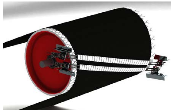
Image above showing 2 x K-Smartscraper®, a paired installation, sold separately.