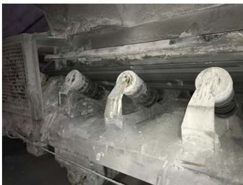
RIGHT Image BEFORE Installation

Premature belt wear and tracking issues were also identified, with material becoming trapped under the conveyor belt and accumulating on the conveyor structure.