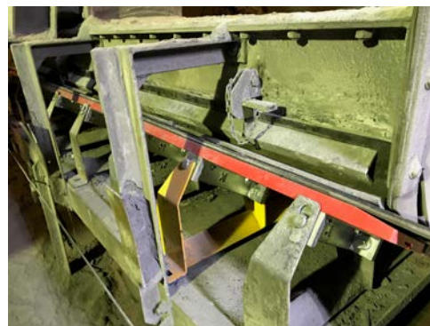
LEFT Image AFTER Installation